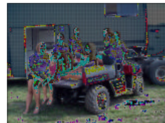
Registrars & scorers reporting to work.