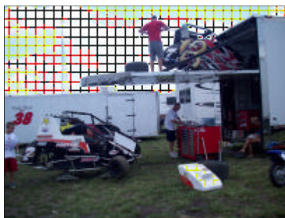
Double decker pit space.