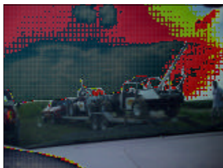
The Buggies are ready to unload.

Ever wonder what goes on behind the scenes at a POWri event? These snaps were taken during the Land of Lincoln Speed Week, July 23/25. Although most of the weekend was eventually washed out, racers made preparations up until the storms hit and the race at Macon was cancelled at 5:00 p.m.